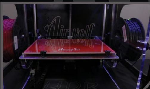
Aluminum backbone with semi-enclosed acrylic frame provide an extremely rigid and durable machine.